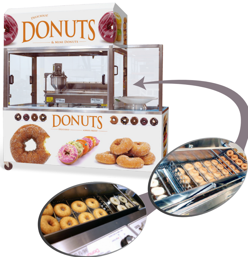
Photo shows Insider with Donut Robot® and Roto-Cooler with sample graphic wrap.

Inset shows Mark II and Mark V GP. The Insider accepts either Mark II • Mark II GP • Mark V • Mark V GP